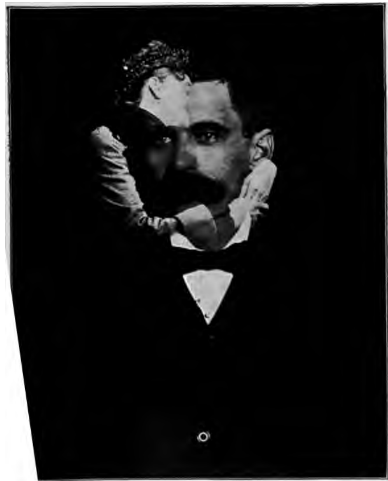
photograph shows many interesting features. The general position extraordinary, but it bears marks of fraudulent manipulation; notably the left hand, and the imperfect nose. The "spirit" is said to be the sitter's wife. This photograph was developed by the sitter himself.